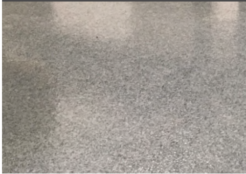
1.650 m 2 Stonhard flooring system

Stonhard is the unprecedented world leader in manufacturing and installing high-performance polymer floor, wall and lining systems. Stonhard maintains 300 Territory Managers and 175 application crews worldwide who will work with you on design specification, project management, final walk through and service after the sale. Stonhard's single-source warranty covers both products and installation.